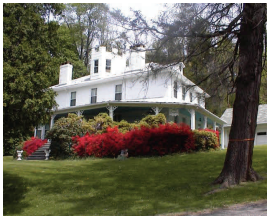
The Evergreen Museum