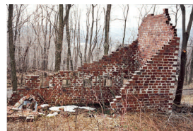
The Miners' Mule Stable