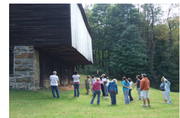
Exploring the Evergreen Barn

The Evergreen Heritage Center Foundation is dedicated to using the Evergreen Heritage Center to providing opportunities for indoor/outdoor learning. To do so, the Foundation has partnered with schools, colleges, and universities as well as public service organizations such as the YMCA, the Salvation Army, the Human Resources Development Commission, and the Maryland Dept. of Juvenile Services, and is offering environmental education and other hands-on learning experiences for children and youth of all ages and circumstances. To learn more, call 301-687-0664.