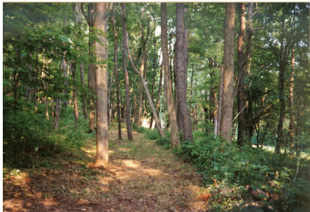
The Evergreen Forest

Evergreen Heritage Center 15603 Trimble Road Mount Savage, Maryland 21545