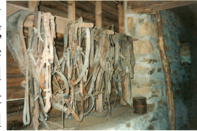
Inside the Evergreen Barn

The Evergreen Barn, also built in the late 1700s , transports the visitor back in time. The Barn was built on a hillside to provide ground level access to the stables in the front, as well as ground level entry to the upper threshing floor by hay wagons. The barn's frame is constructed with large wooden pegs (not nails) and its cantilevered beams (made from hand-hewn logs) are over 45' long. The Barn is open for private tours and to the public per the Museum's schedule.